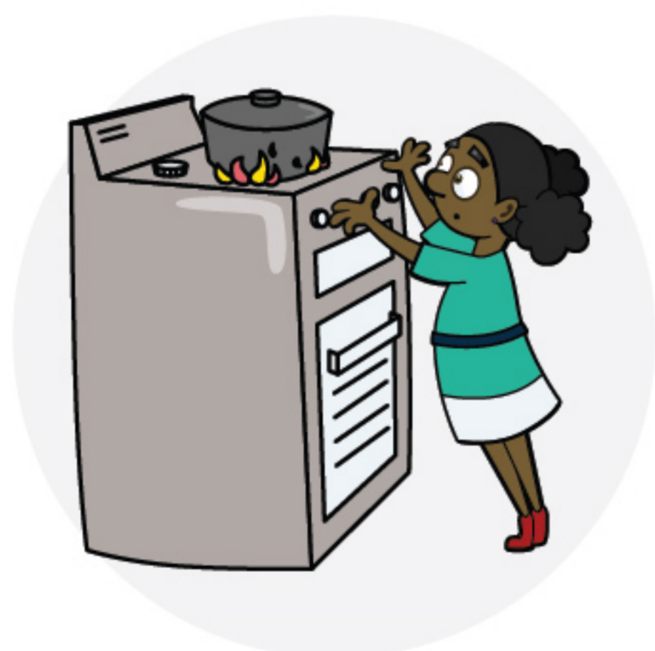
Leaving a child without supervision