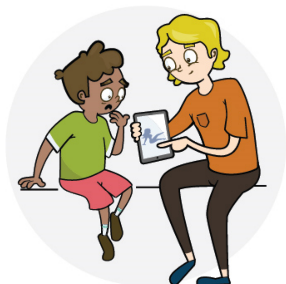
Showing pornography to a child