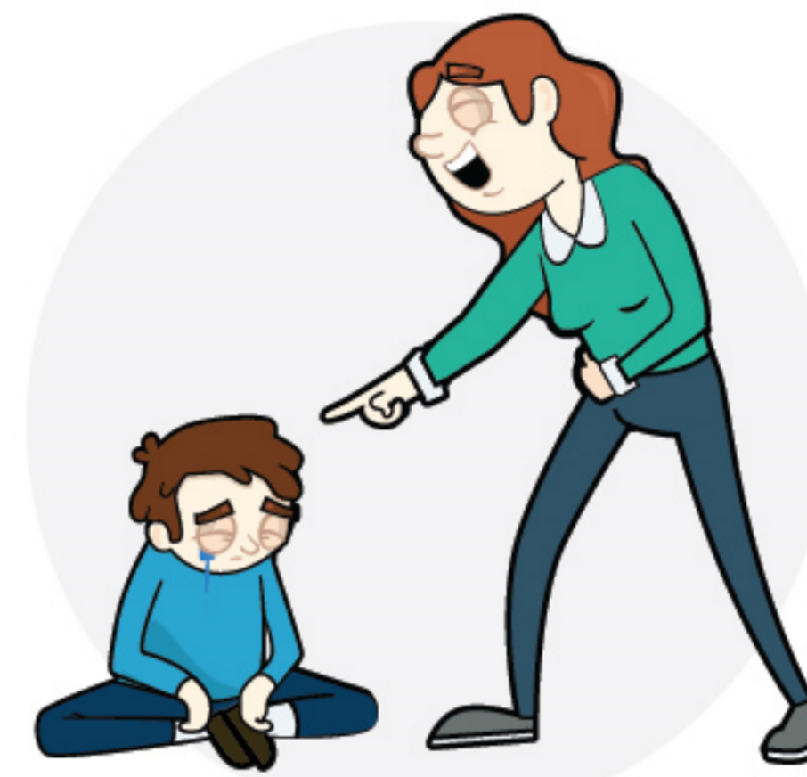
Teasing or humiliating a child