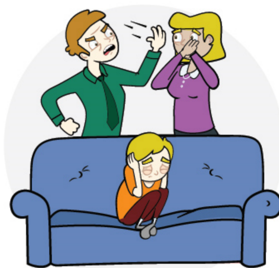
Exposing a child to violence