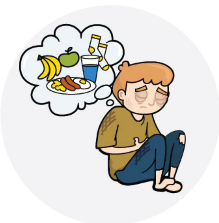
Not providing adequate food, clothing or medical needs for a child