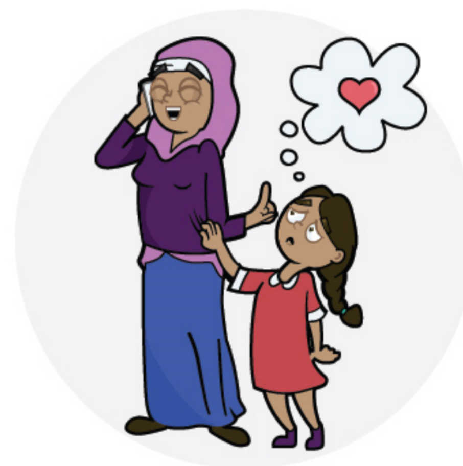
Depriving a child of love and attention