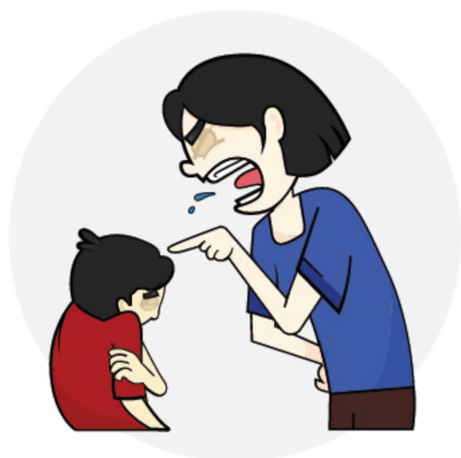
Yelling at or threatening a child