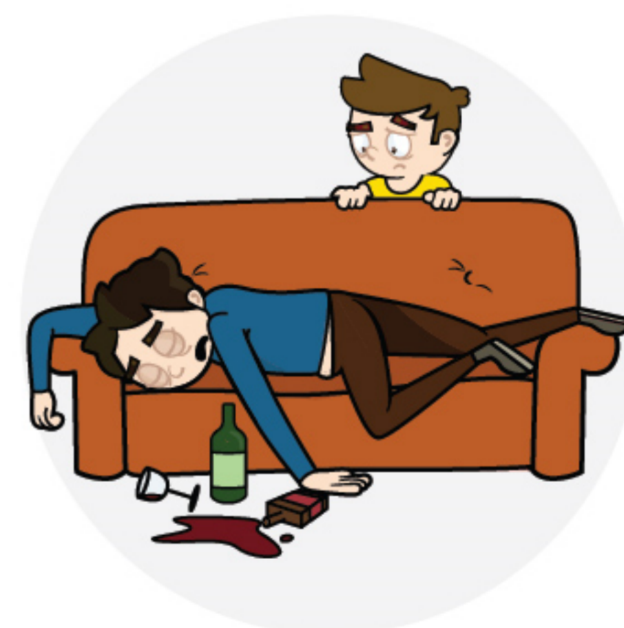
Being intoxicated in front of a child