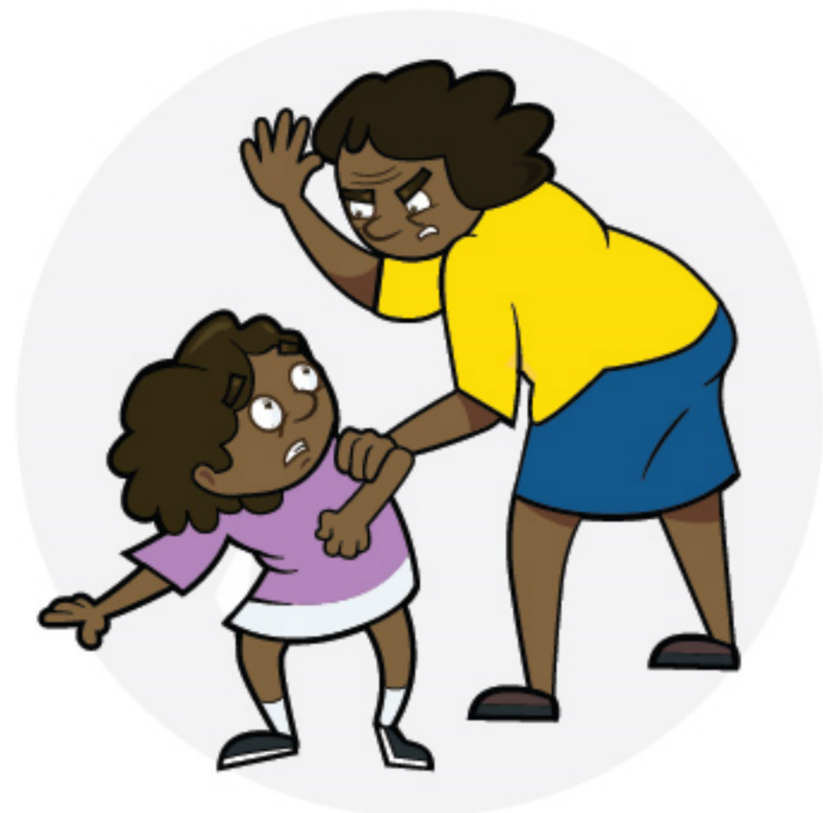
Hitting or hurting a child physically