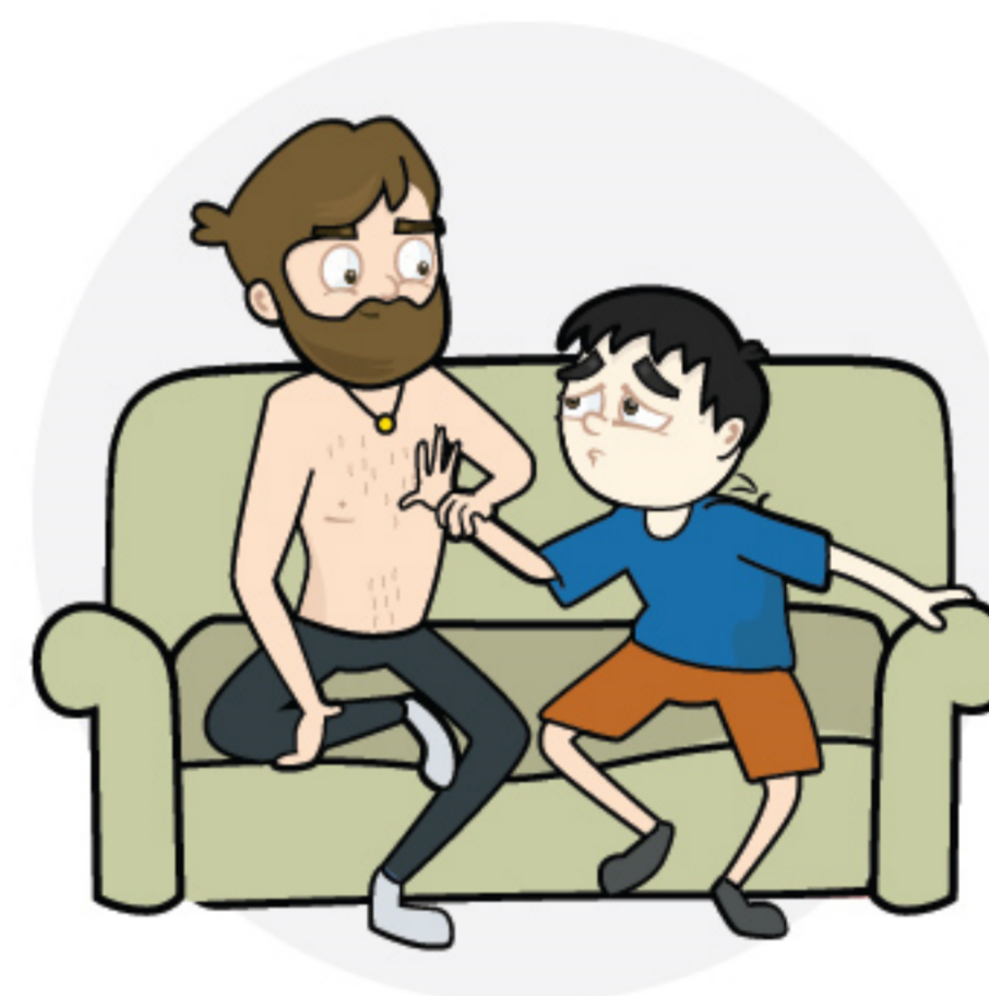
Forcing a child to touch you