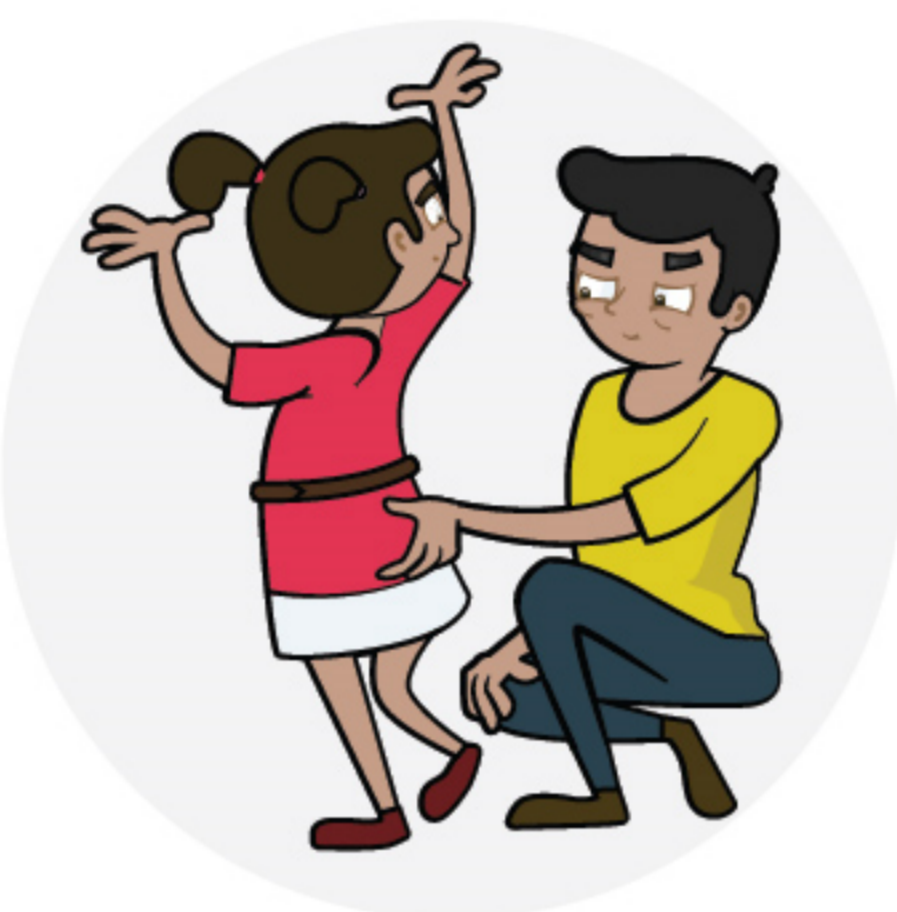
Touching a child's private parts